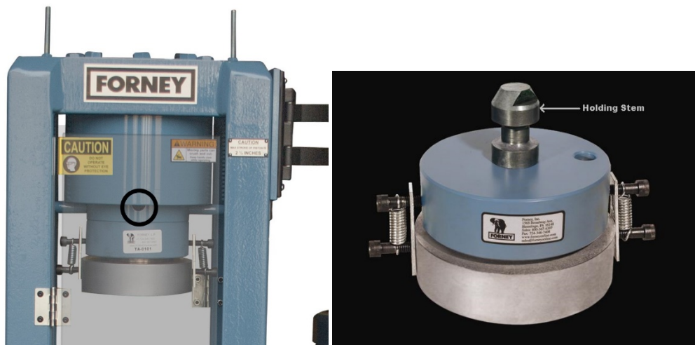
Figure 1 - Set Screw and Holding Stem locations

Jog advance the piston about 1" and leave the machine in jog hold to allow access to the set screw installed in the piston. Lift the accessory into position below the piston inserting the holding stem firmly into the hole centered in the bottom of the piston. Then tighten the set-screw against the holding stem locking the accessory in place. There should not be any force during testing on the holding stem or set screw. The force should be between the piston and blue seat of the testing accessory.